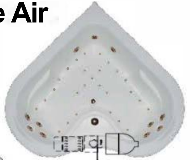
PUMP & BLOWER La